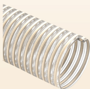
NETTUNO (cod. NQ) p.107

*Disponibile su richiesta, per quantitativi da concordare con l'ufficio vendite.