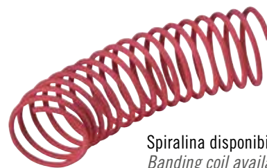
Spiralina disponibile (Cod. SC EN) Banding coil available (Code SC EN)