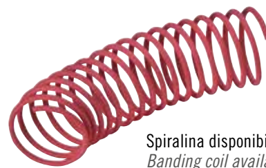
Spiralina disponibile (Cod. SC EN) Banding coil available (Code SC EN)